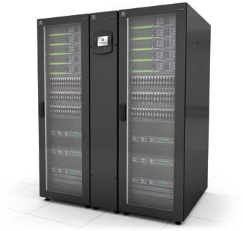
System with Liebert DCL unit for highest availability