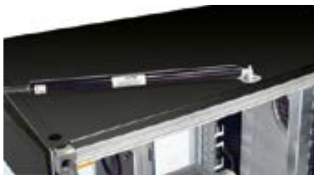
Automatic emergency door opening option for server rack