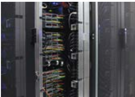
Vertiv™ Knürr® DCM Heavy-Duty Rack server rack for cooling with Liebert DCL, Liebert power distribution modules and integrated cable management