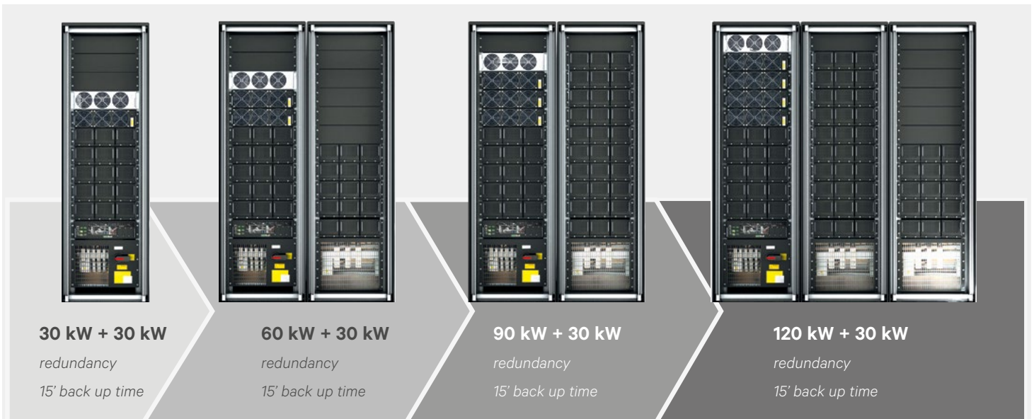
Liebert APM 30-150 kW

Increases in capacity and redundancy can be made both vertically and horizontally by adding power modules to an existing UPS cabinet or, by connecting complete UPS systems in parallel in order to reach a maximum of 2.4 MW of active power.