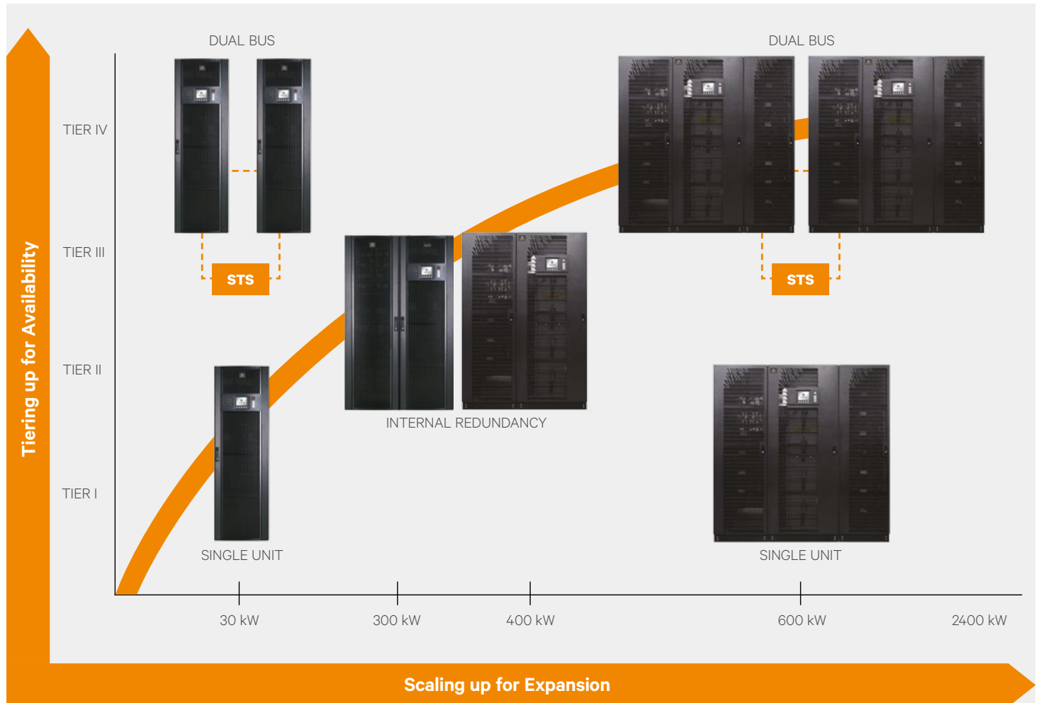
Liebert APM - Designed for "pay-as-you-grow" deployment

Additionally, Liebert APM allows easy deployment of Tier 4 architecture through its integrated dual bus control.