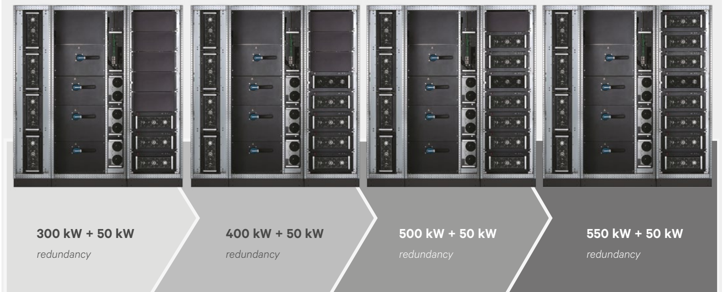
Liebert APM 50-600 kW