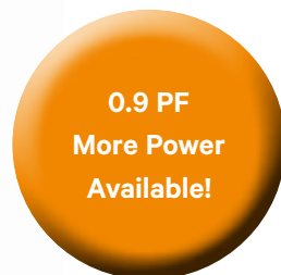
Liebert GXT3 10000 VA Tower