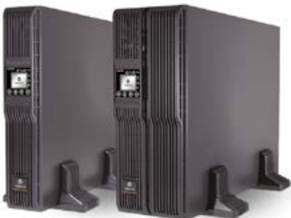
Liebert GXT4 700 - 3000 VA